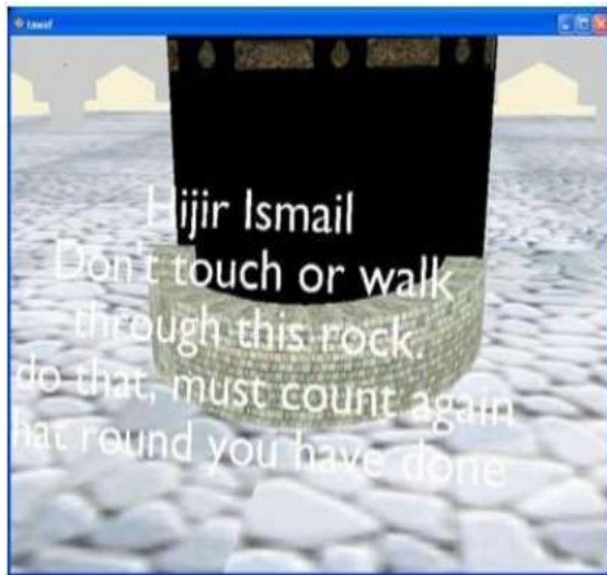
Fig. 5: Starting page of tawaf simulation.