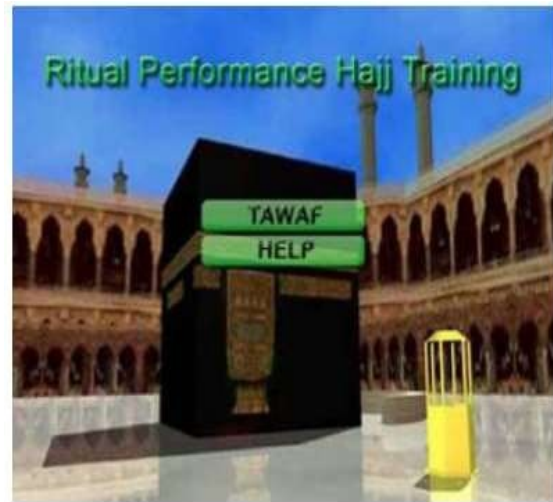
Fig. 3: The 3D environment construction

The system's interface provided a concise overview of the interplay between the design and analysis phases, the results of which were represented in a three-dimensional model of the Ka'ba guy avatar dressed in ihram was shown in the user interface. The interfaces' backgrounds were designed to seem like the real situation.