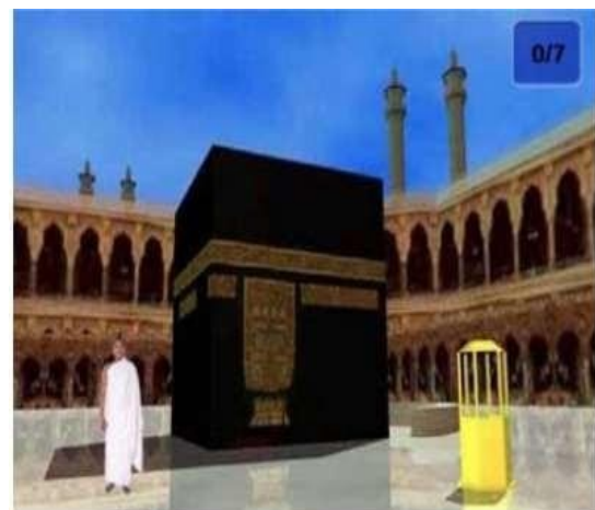
Fig. 4: Ka'ba and the view around it

Hajj performance training and 3D environment visualization starting page, as shown in Figure 4. The Kaaba and its surroundings, including a beautiful sky, were featured prominently on the homepage. The user has the choice of clicking the tawaf or the help button.