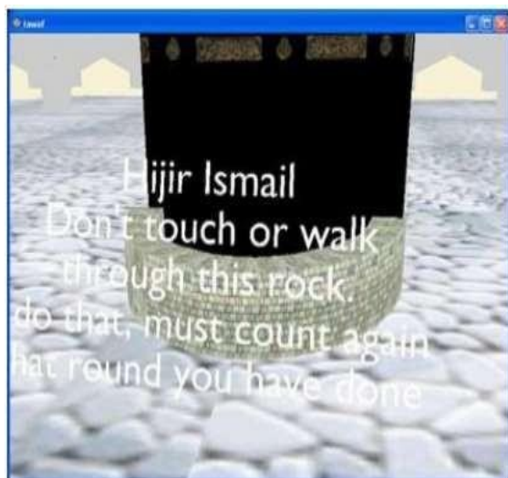
Fig. 5: Starting page of tawaf simulation.