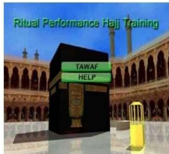
Fig. 3: The 3D environment construction

The system's interface provided a concise overview of the interplay between the design and analysis phases, the results of which were represented in a three-dimensional model of the Ka'ba guy avatar dressed in ihram was shown in the user interface. The interfaces' backgrounds were designed to seem like the real situation.