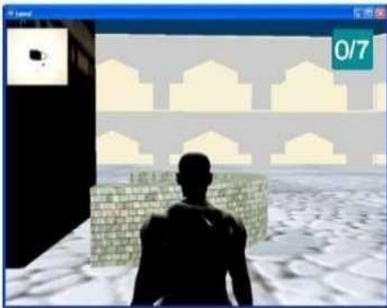
Fig. 2: The 3D environment construction two

required seven circuits of the Kaaba. Figure 2 shows an avatar representing a human model who is prepared to do tawaf. The user's avatar served as a moving target for the camera, allowing for a constantly shifting perspective. Only the camera's viewfinder could see the photos. Rukku Hajar Al-Aswad served as the starting point. The clap counter was located upper right. Users' tawaf round counts were shown. When a round was over, the lap counter would advance by one. Whenever the user moved the main window, the map view at the top left of the interface updated to reflect the new perspective. You can really get a sense of practicing tawaf in the genuine area thanks to the immersive audio in this scenario. Hajar Al-Aswad is a rock located in the Ka'ba's (the black cube's) corner. The proper direction of travel around the Ka'ba is counterclockwise. Users had to restart the process from the beginning if they were going in the incorrect direction.