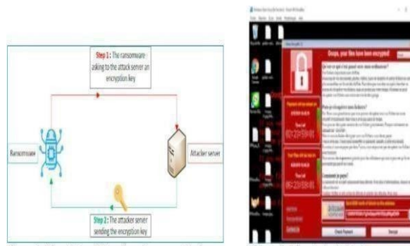
Fig 2 : The victim PC getting the encryption key and the victim PC being encrypted

The arrangement of the research is as follows: Section